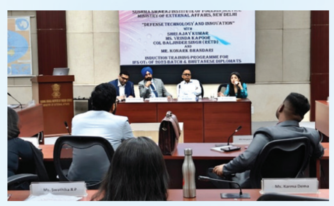
A day-long technology module organized by Carnegie India

The OTs and the Bhutanese diplomats were attached to various entities in New Delhi such as NDMA, CDRI, Parliamentary Research and Training Institute for Democracies (PRIDE), the External Publicity & Public Diplomacy and Protocol Divisions of the Ministry of External Affairs.