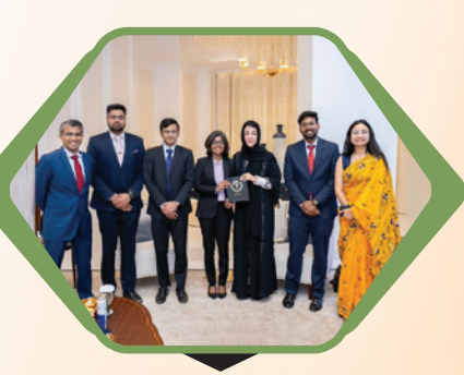
Call on MoS for Foreign Affairs of UAE