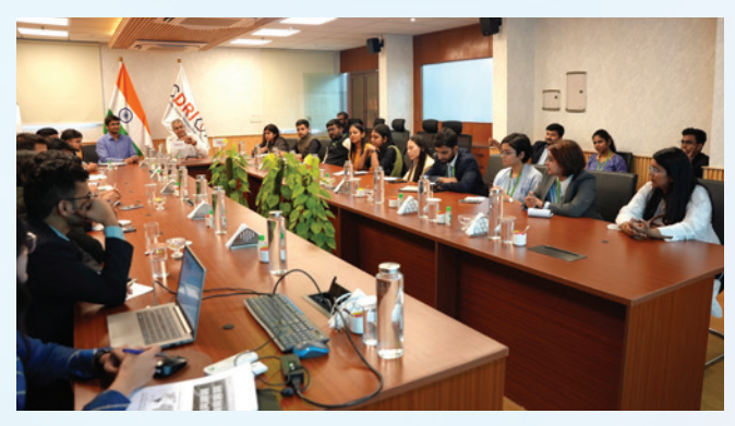
Visit to CDRI, New Delhi

The OTs and the Bhutanese diplomats were attached to various entities in New Delhi such as NDMA, CDRI, Parliamentary Research and Training Institute for Democracies (PRIDE), the External Publicity & Public Diplomacy and Protocol Divisions of the Ministry of External Affairs.