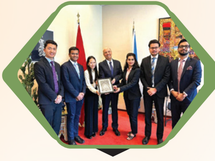
Meeting with HRC President in Geneva