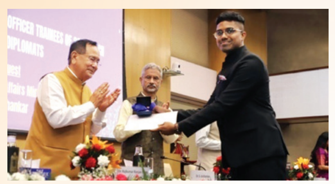
Silver Medal (Esprit d'corps)