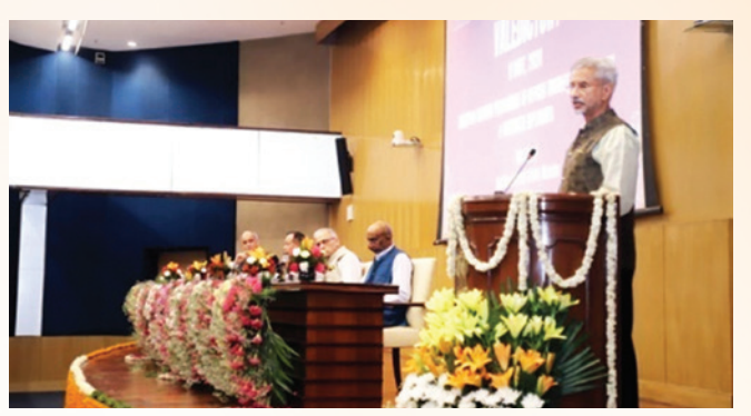
EAM at the Valedictory Function